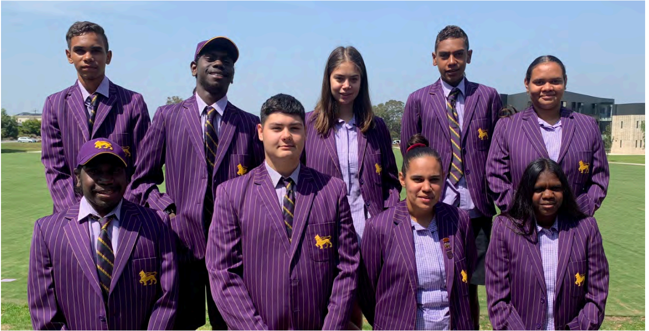
In a year characterised by the challenges of remote learning and travel limitations, the performance of our Year 12 students was impressive.