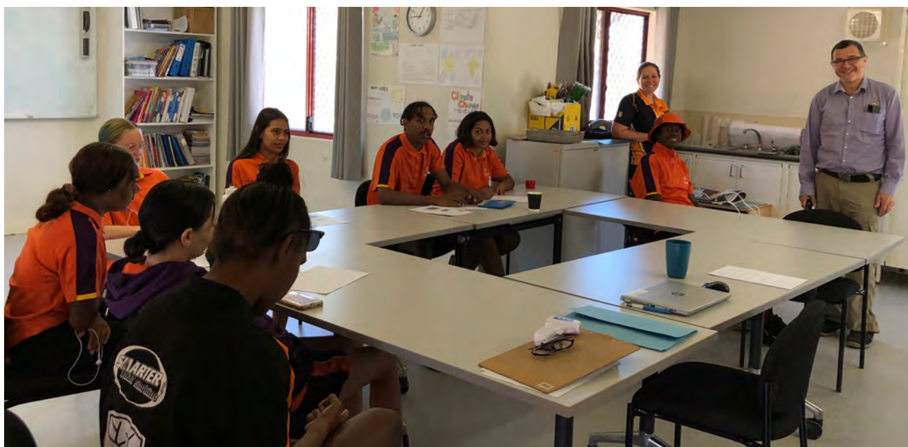
The creation of new and innovative online learning platforms and approaches connecting students and staff across Australia to learning offsite, and away from school.