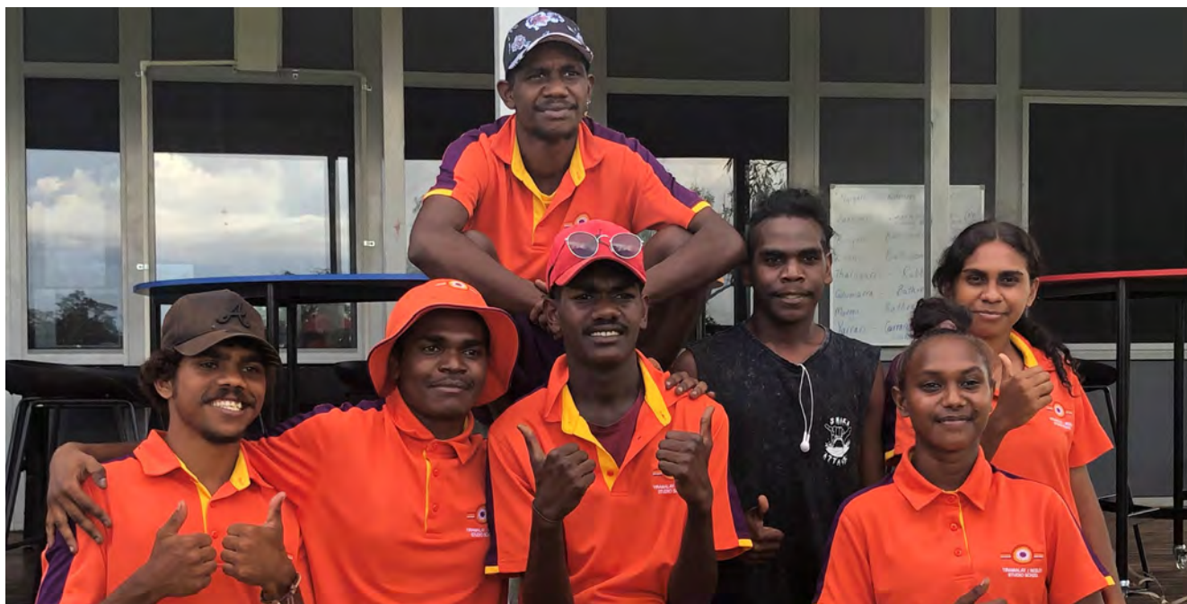
'Yoramalay/Wesley Studio School aims to expand the horizons and life choice expectations of our youth.'