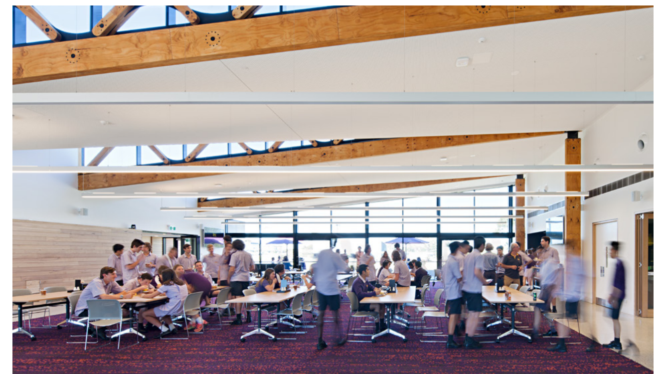
Boarders have access to a communal dining space, with adjacent games room and study space

Every interest and talent is catered to, with boarders accessing the extensive sporting facilities on-campus. These include five ovals, an indoor pool, gymnasium, basketball court, athletics track, hockey pitches, tennis courts, netball courts and playing fields for cricket, football and soccer.