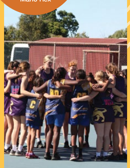
Clockwise from top: 2018 Gibb Challenge participants engaged with the wider community for a good cause; Yiramalay's netballers celebrate their 2018 Kimberley Cup Championship win; Yiramalay's footballers celebrate their 2018 Kimberley Cup Championship win.