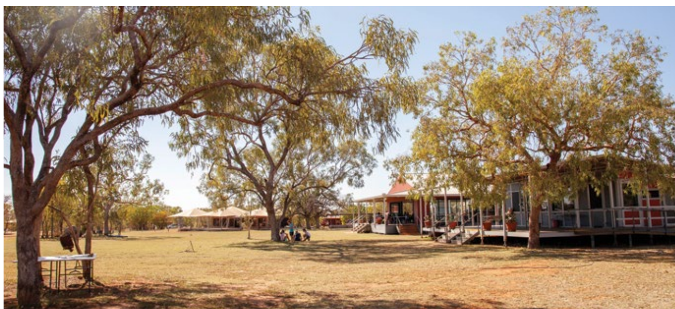
New student accommodation was opened in May