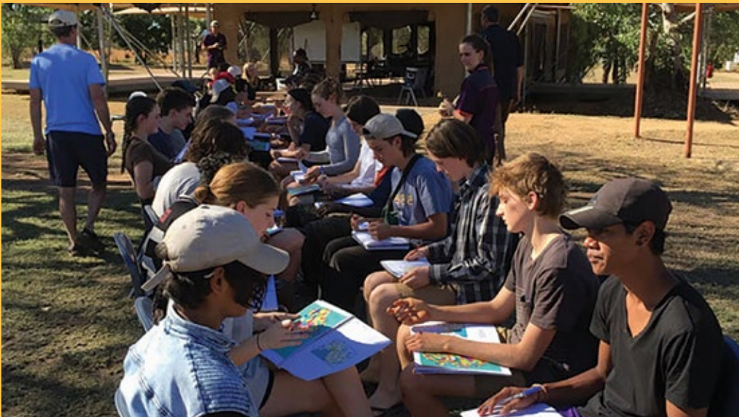
Inductions during 2018 brought together students to learn with and from each other