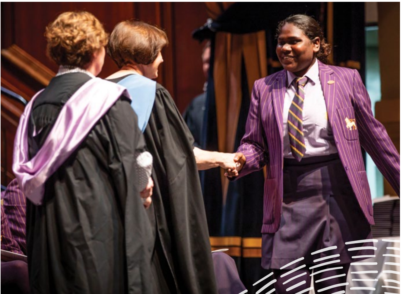
A record 10 Yiramalay students graduated in 2018

IT WAS A DEEPLY MOVING EXPERIENCE TO SEE OUR GRADUATING YIRAMALAY STUDENTS DEFYING THE ODDS AND CHANGING THE LANDSCAPE OF SCHOOL COMPLETION FOR AUSTRALIA'S INDIGENOUS PEOPLES