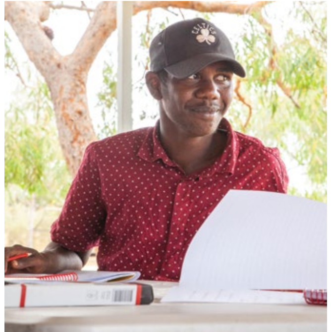
Learning on country takes many forms at Yiramalay