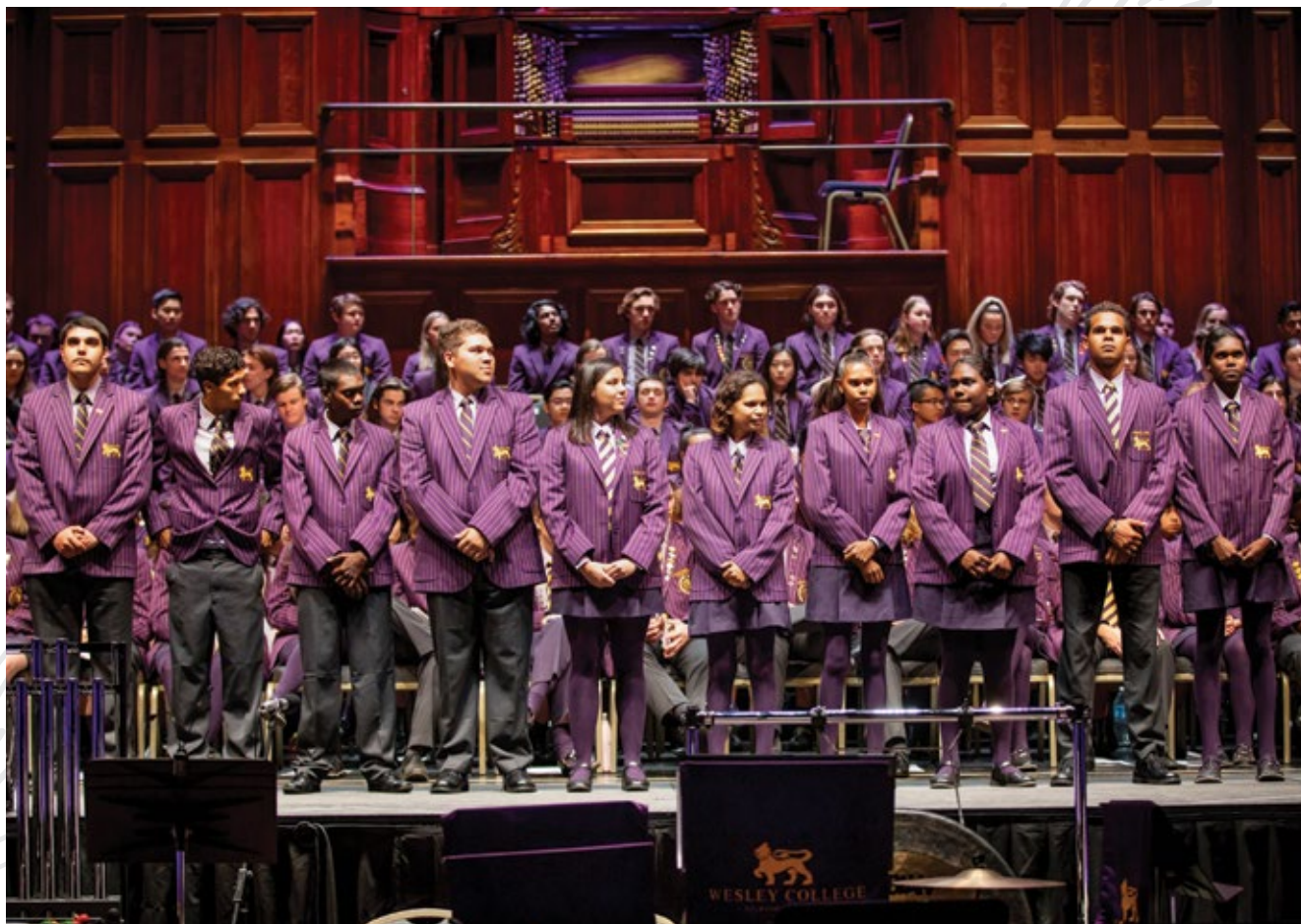
The excitement and applause at the 2018 Glen Waverley Campus Speech Night was a tangible endorsement of the Yiramalay program