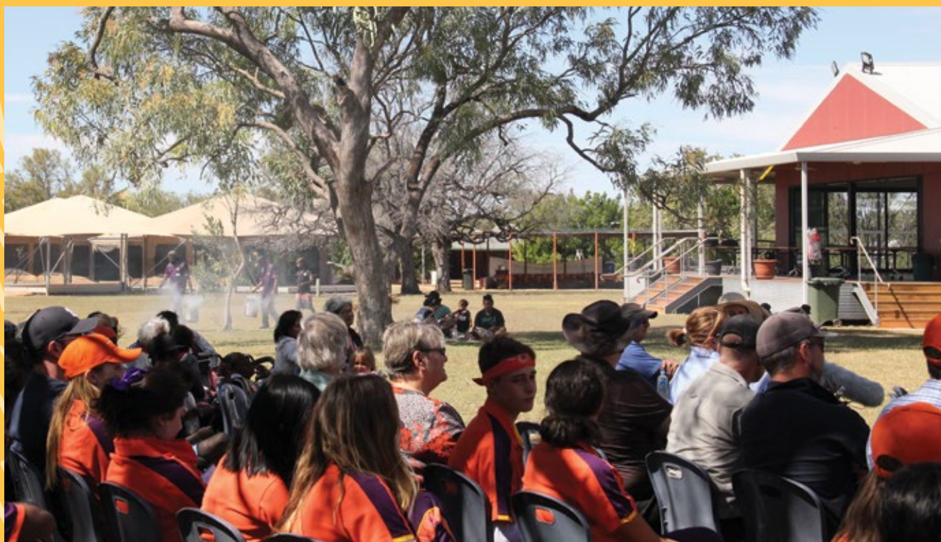
Attendees at the official opening of new student accommodation in May