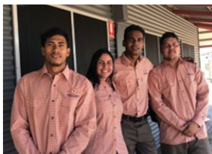
Students model the new Yiramalay uniform introduced in 2018

In 2018, nine students graduated from their programs within the Senior Years Learning Framework Standard Level, and one student from their program within SYLF Advanced Level.