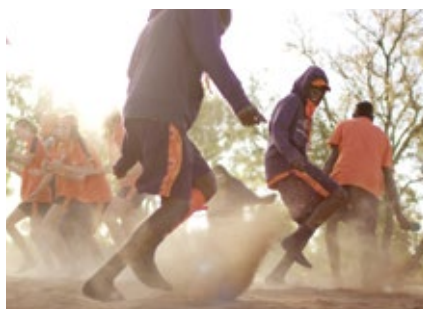
Two-way learning enabled students to share many cultural experiences during the 2018 Induction program

The course is designed for students interested in moving directly into work or further vocational education at the completion of secondary school. The course is nationally credited as a Certificate II in Work and Vocational Pathways, providing training for employment in a range of industries and/or further study.