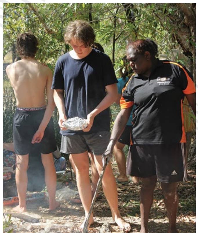
Teaching staff at Yiramalay engage in professional development through the Teacher Learning and Collaboration Program