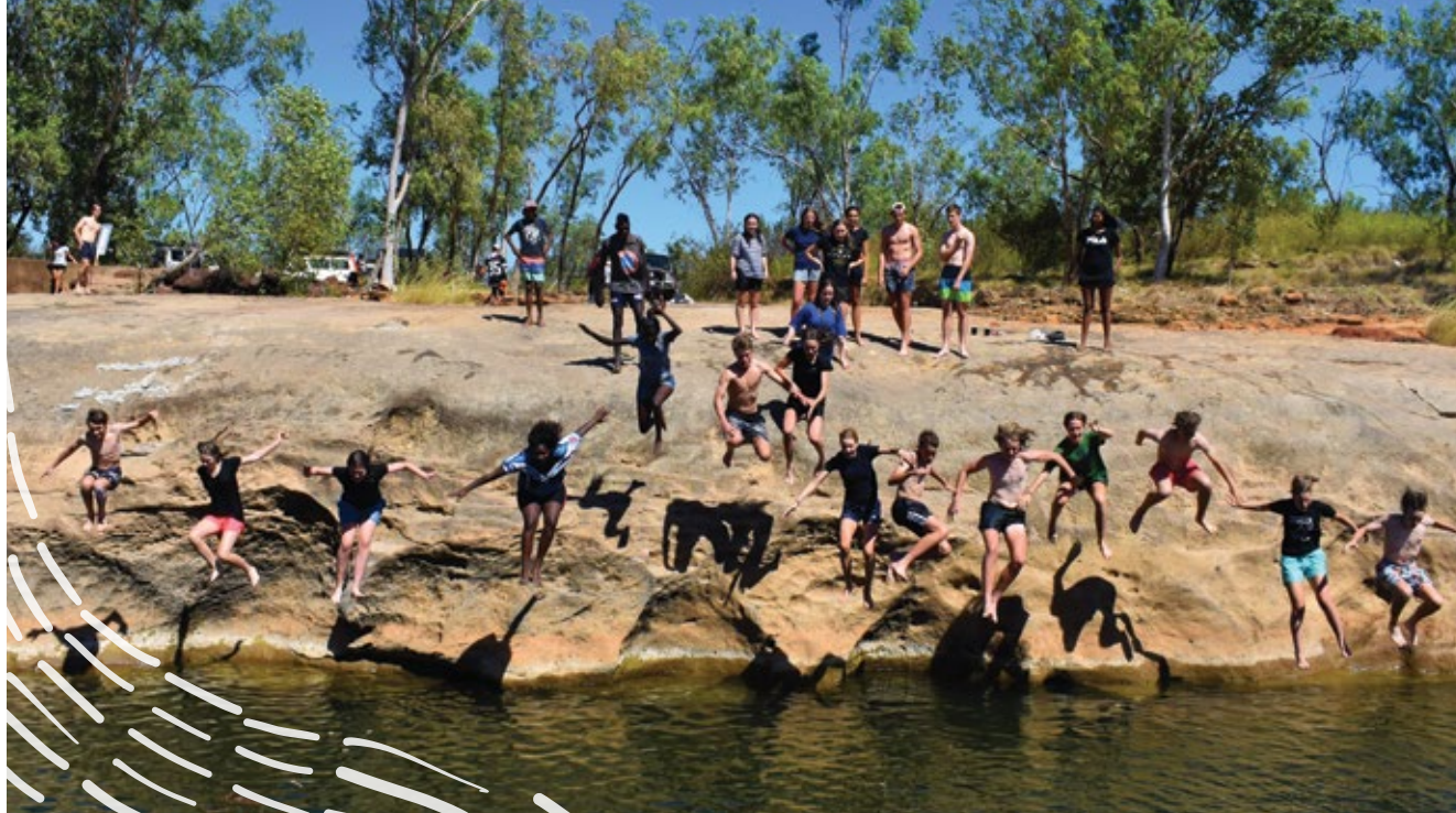
Students jumped into the 2018 Induction program with enthusiasm