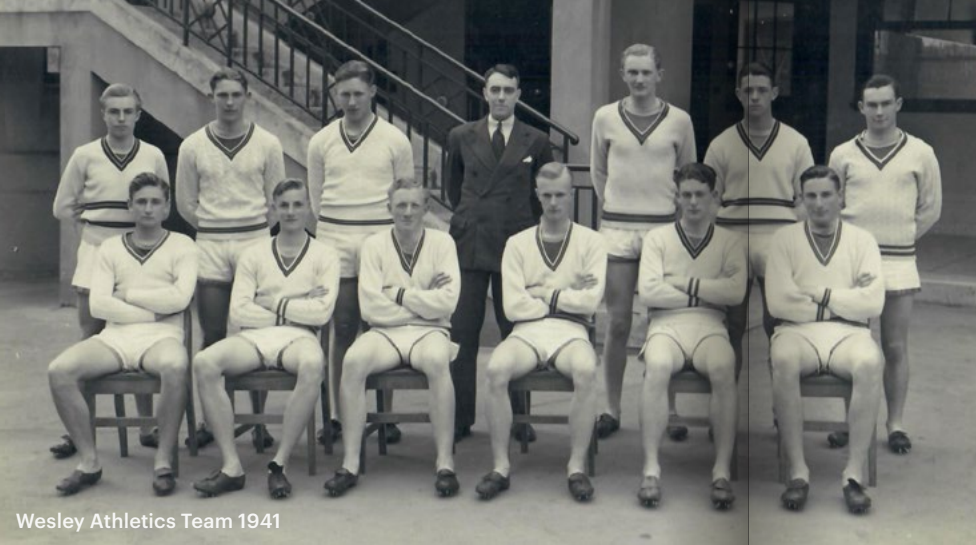
Wesley Athletics Team 1941