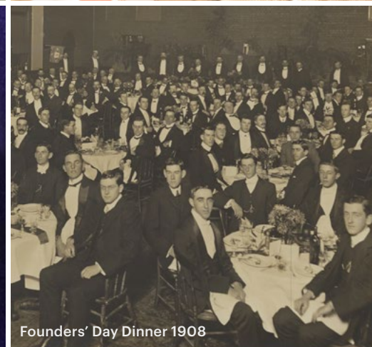
Founders' Day Dinner 1908